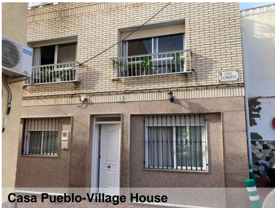
Casa Pueblo-Village House